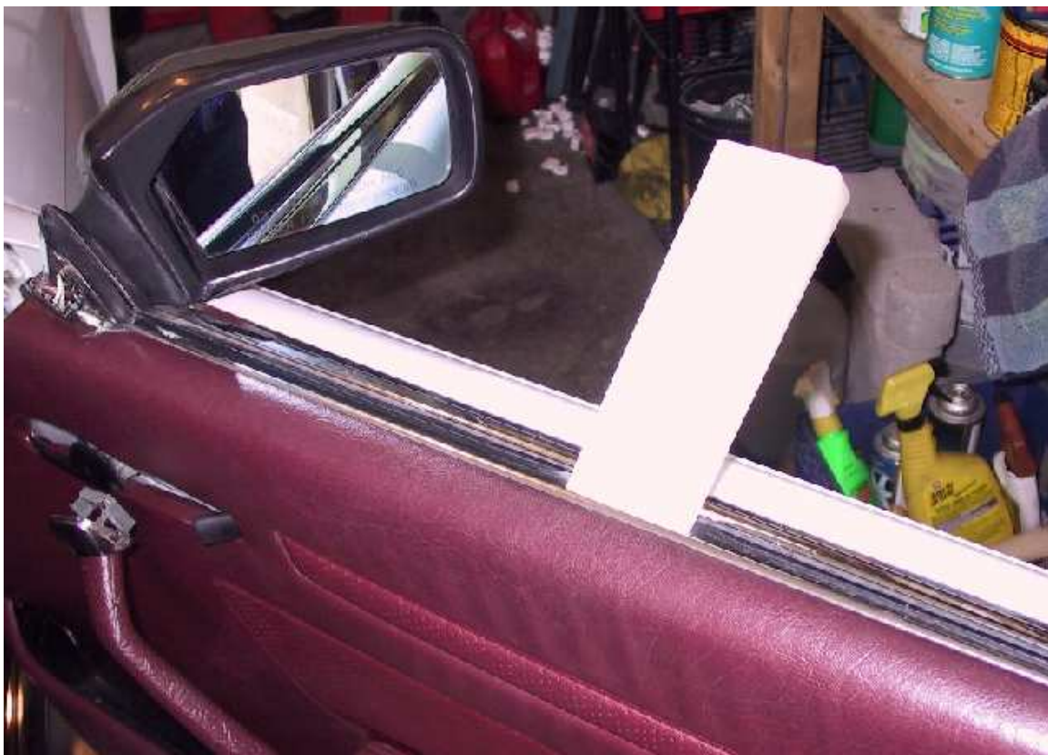
As shown in the photo, use the wedges to pull up and out as shown, to remove the panel and